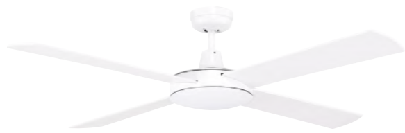
Ceiling Fan (White)