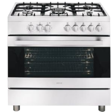
900mm Freestanding Gas Cooktop