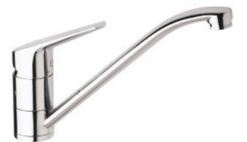
Laundry sink mixer in chrome