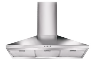
900mm Canopy Rangehood