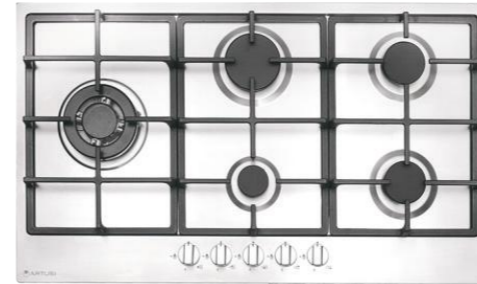
900mm Built-In Oven & Gas Cooktop