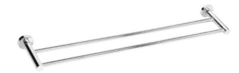
Double towel rail