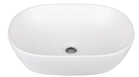
Benchmark vanity basin