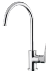
Kitchen sink mixer