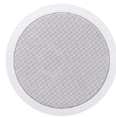
Bluetooth Speakers (White)