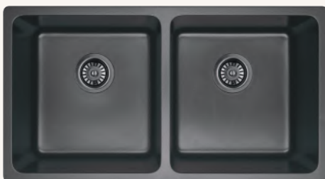
Square edge undermount double bowl sink