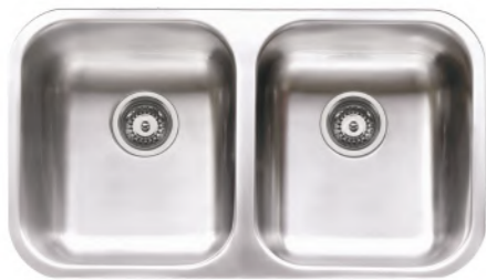
Rounded edge undermount double bowl sink