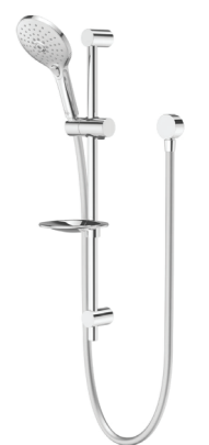
Single rail shower