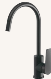
Kitchen sink mixer