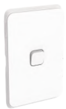
Clipsal Iconic slimline (White)