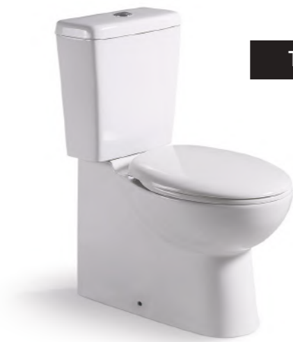
Square back to wall toilet suite

Floor to ceiling tiling included from the Builders standard range to ensuite, bathroom and rear wall only of WC.